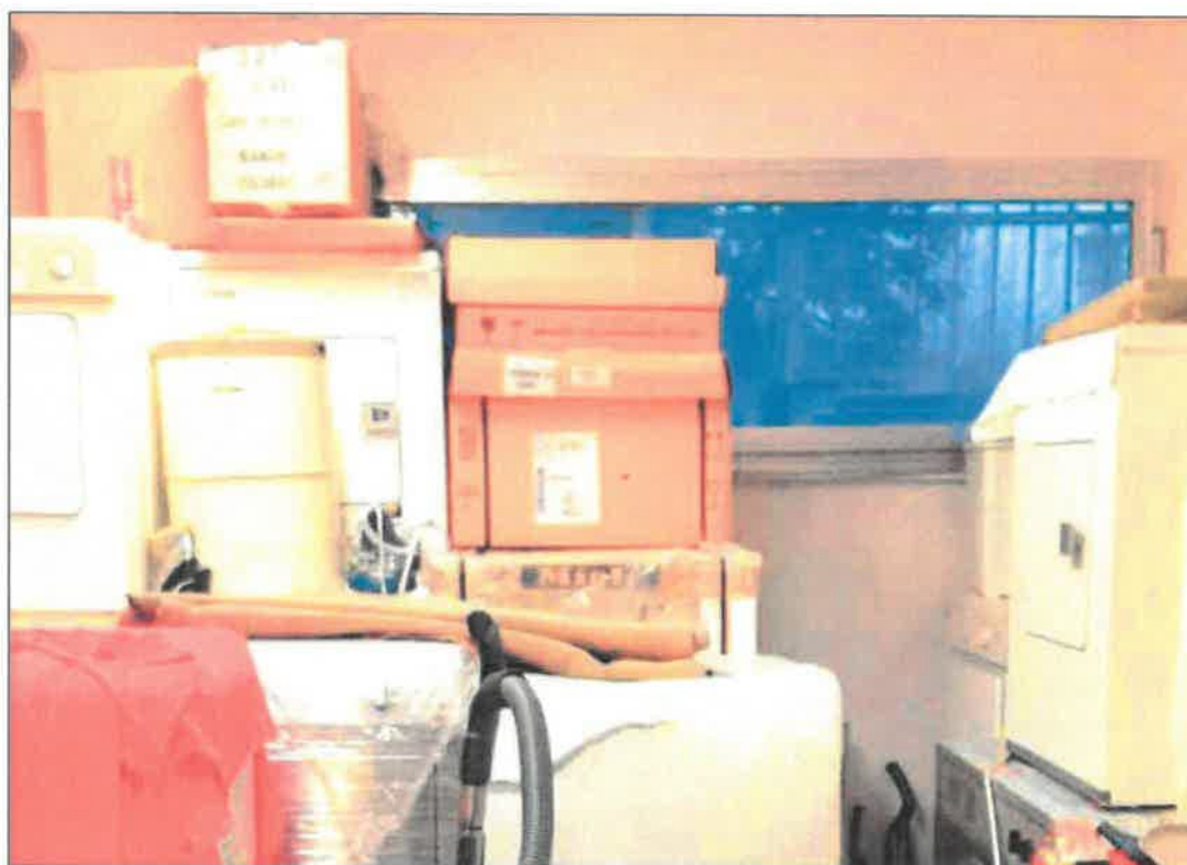
(4 – DEPOSITO P.T.)