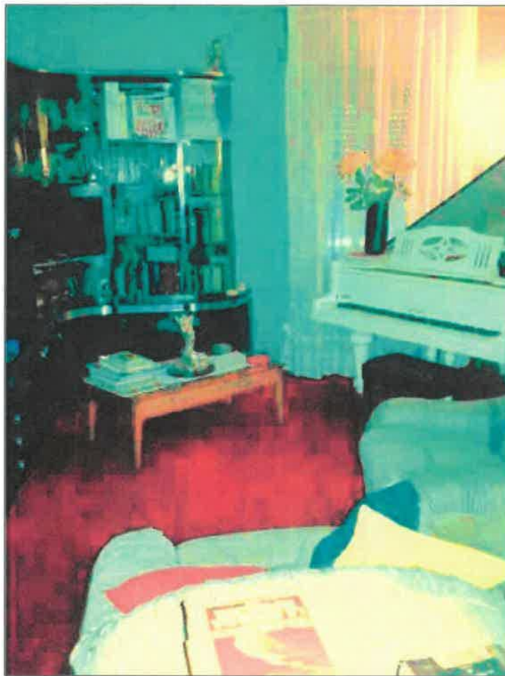
(5 – SOGGIORNO P.1°)