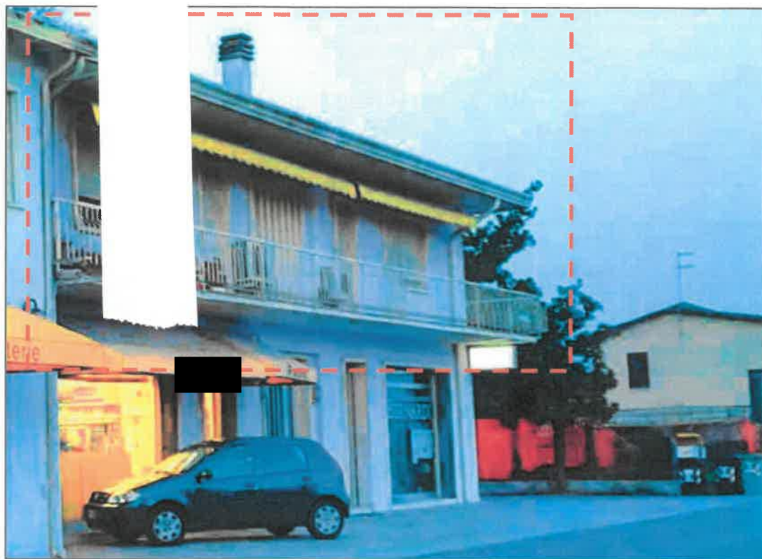
(1 – ESTERNO ABITAZIONE LATO SUD)