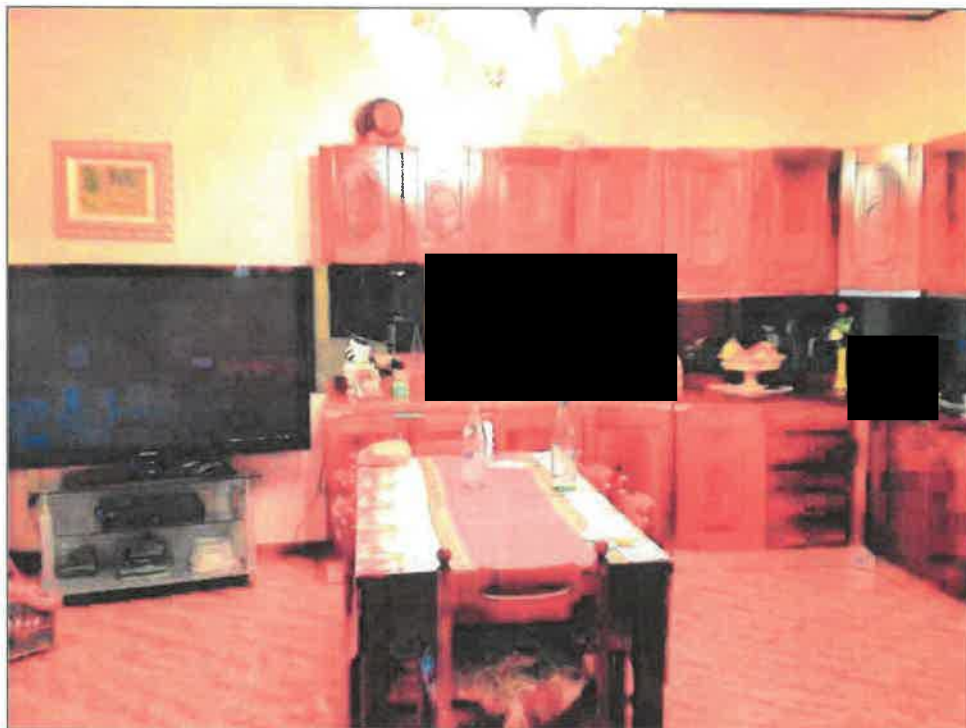
(6 – SALA PRANZO P.1°)