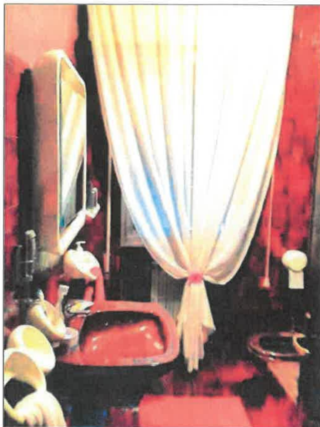
(7 – BAGNO P.1°)