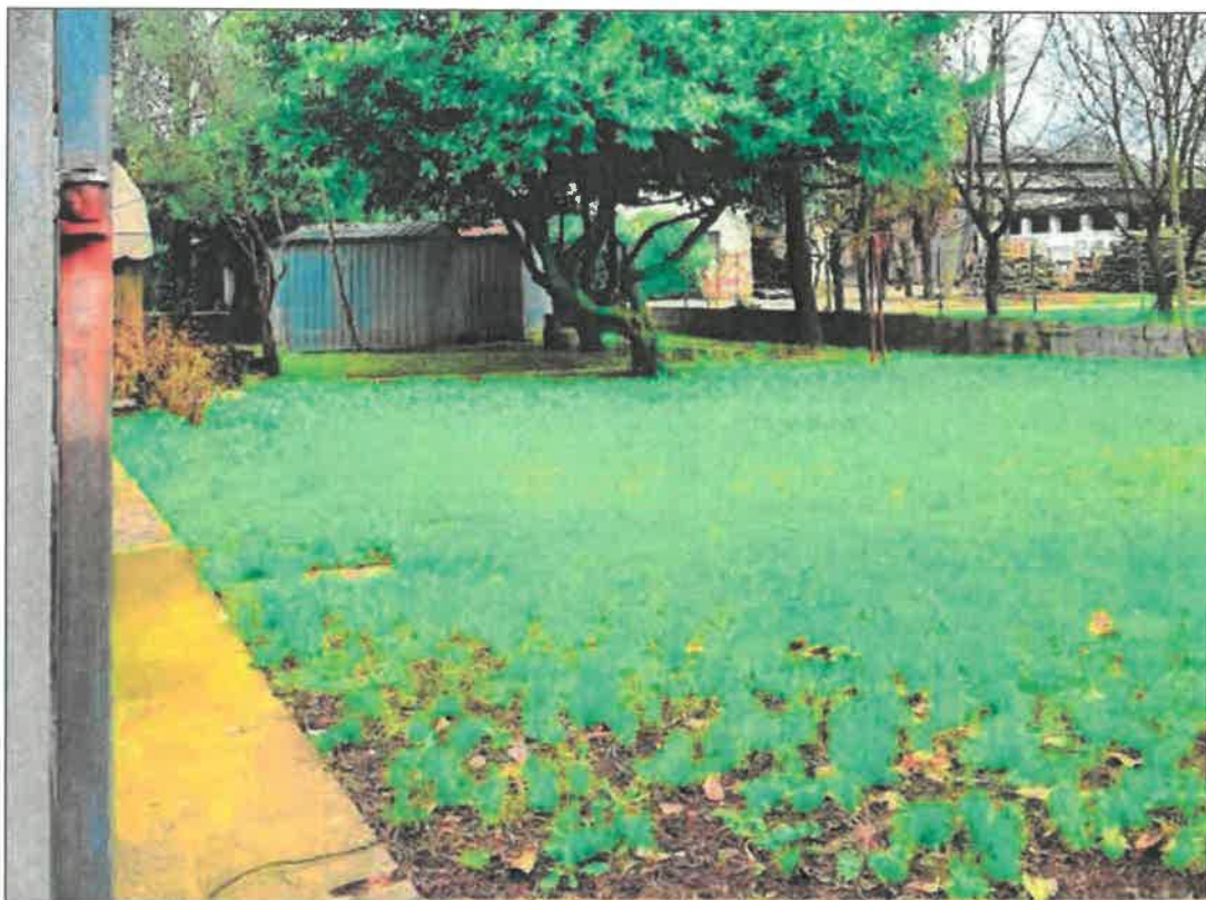
(3 – CORTILE ESCLUSIVO A NORD)