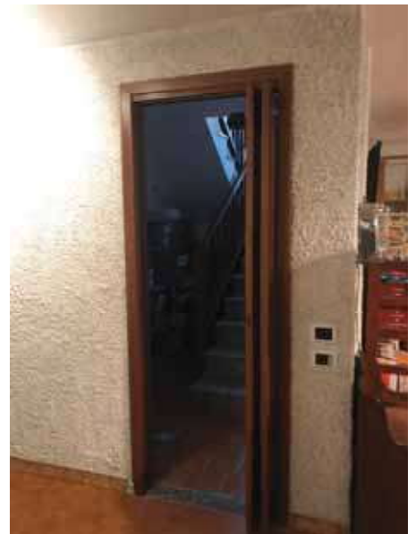
PORTA DA TAMPONARE