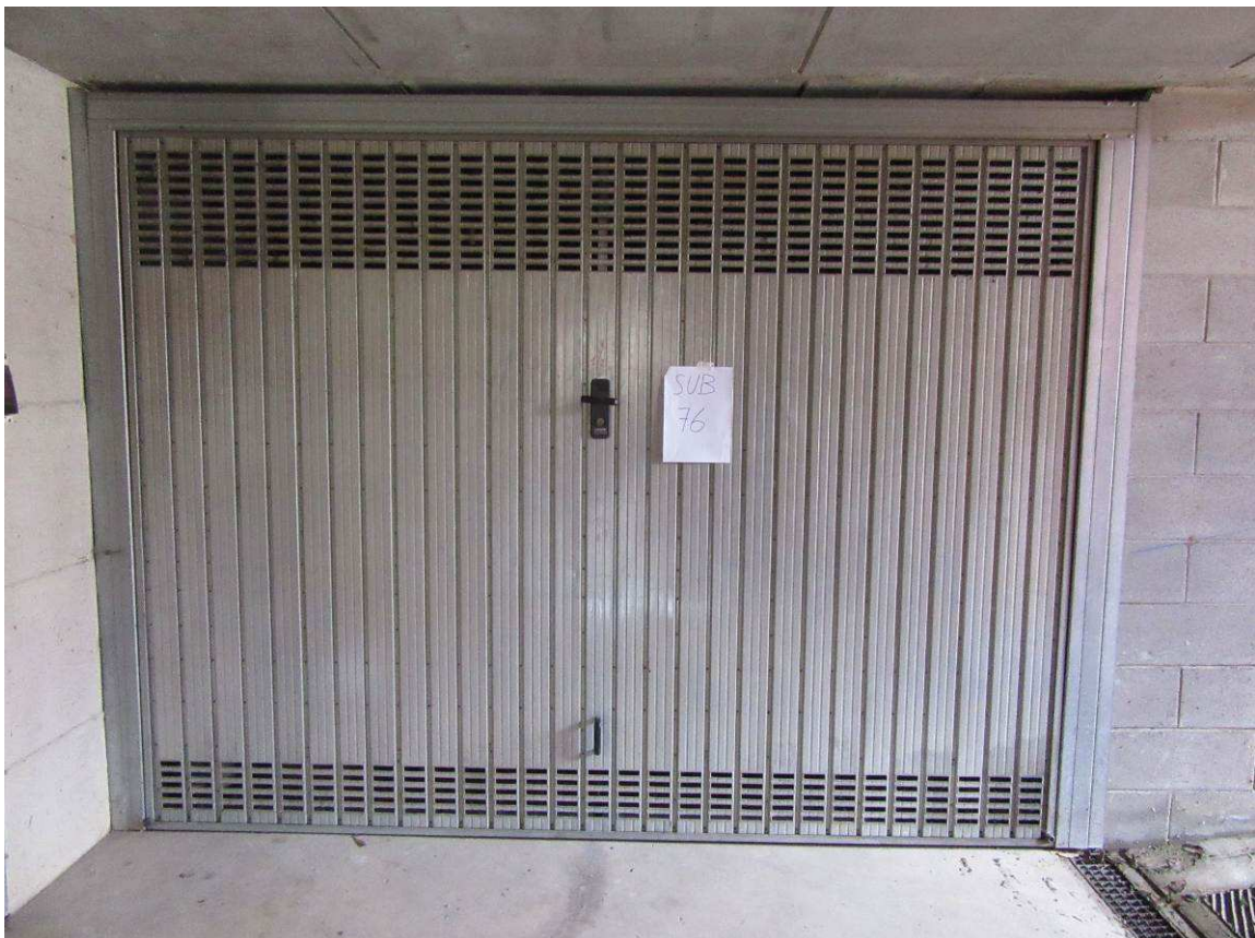
box auto sub. 76