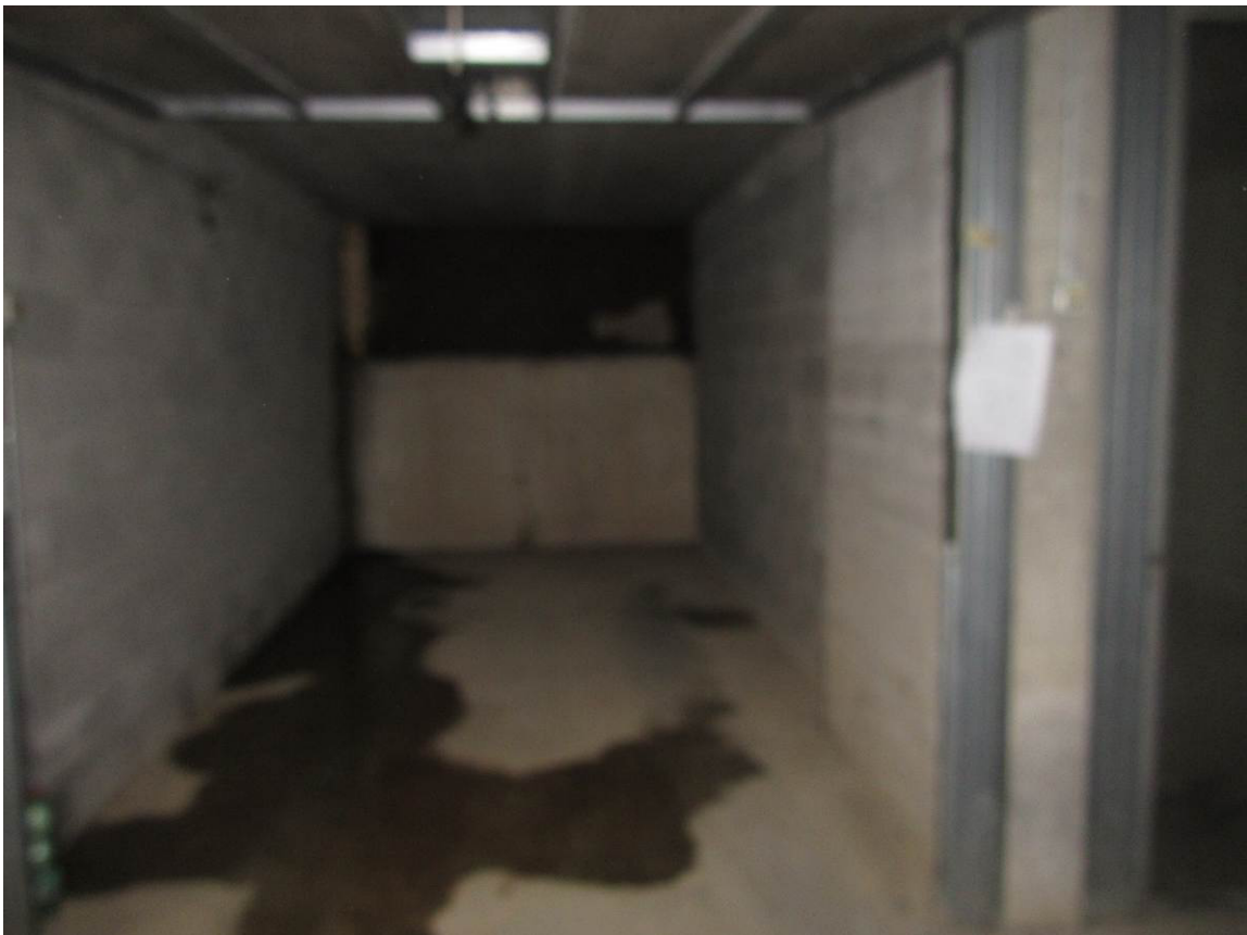
box auto sub. 70