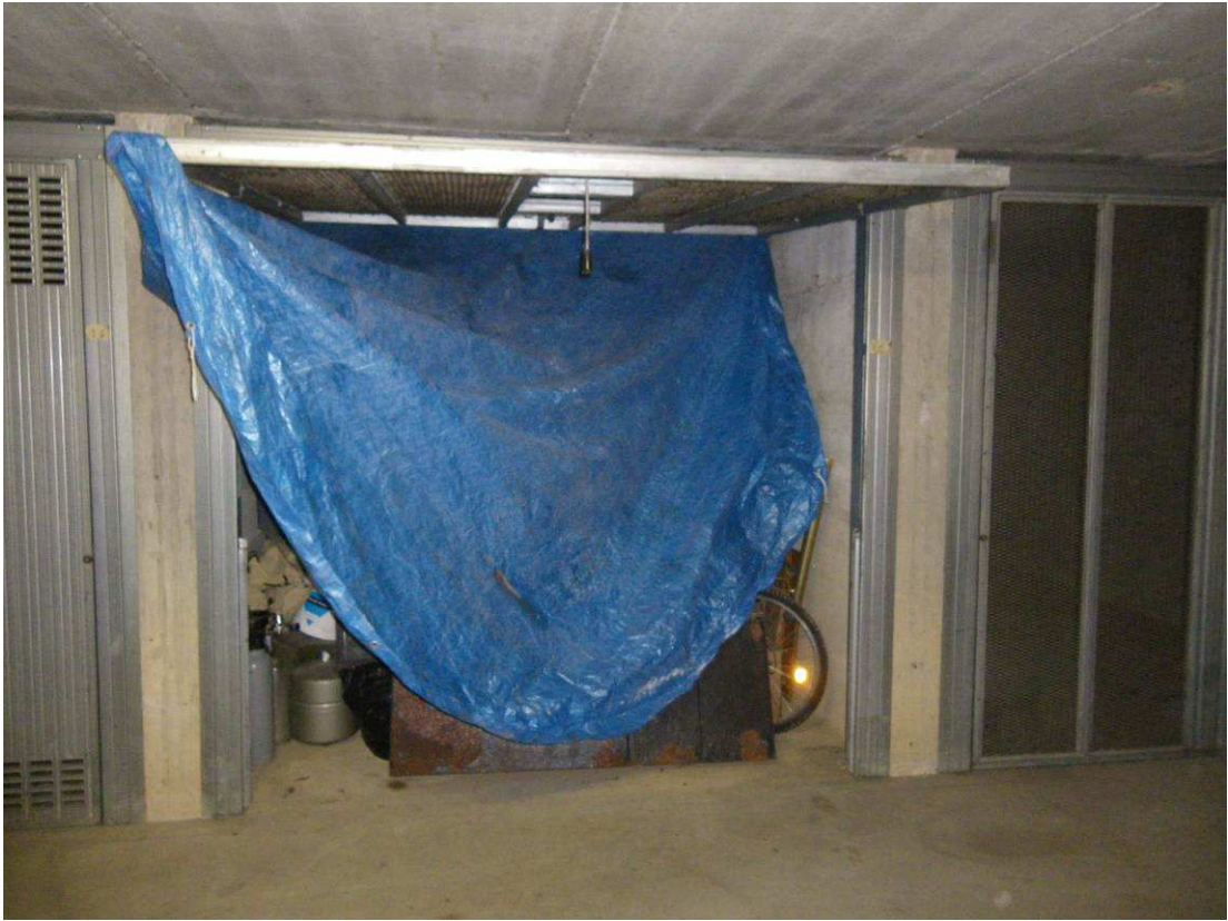
box auto sub. 63