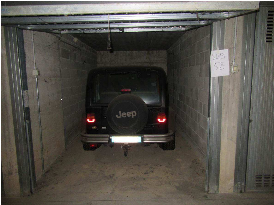
box auto sub. 58