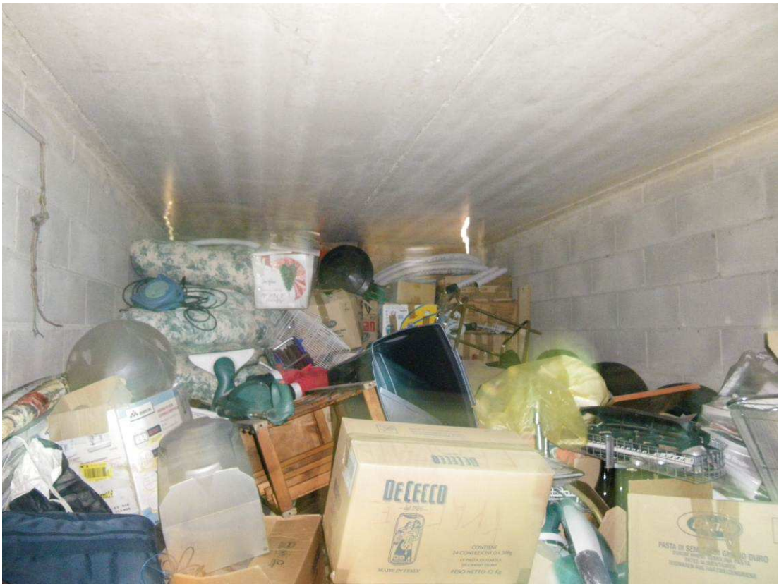
box auto sub. 63