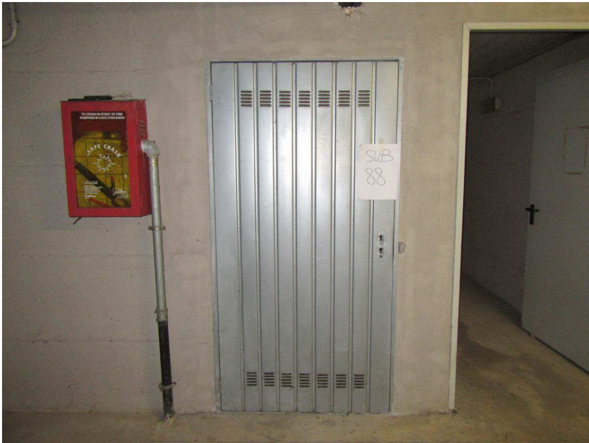
vano cantina sub. 88