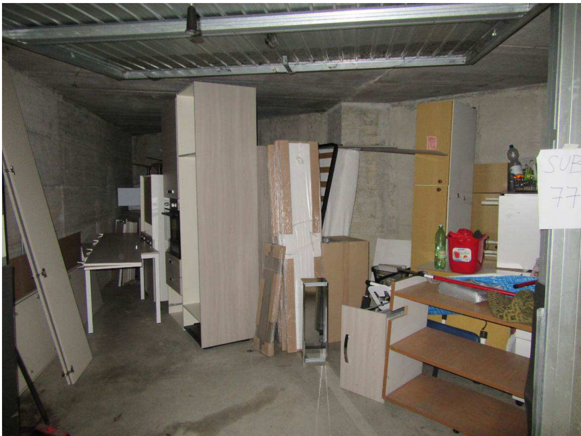
box auto sub. 77