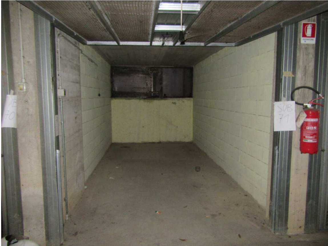
box auto sub. 71