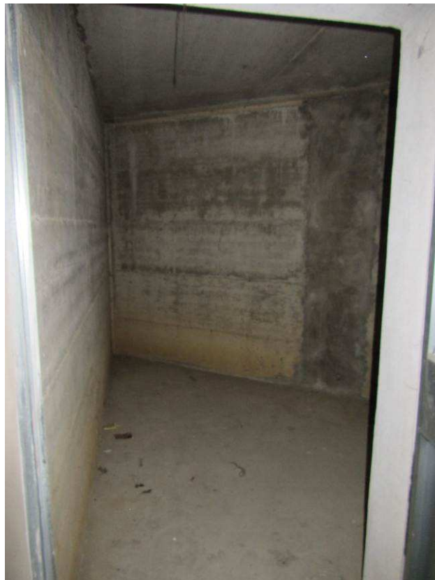
vano cantina sub. 87