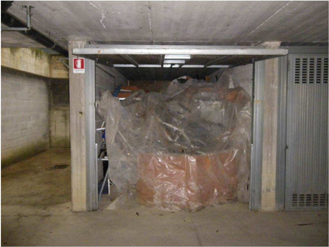
box auto sub. 57