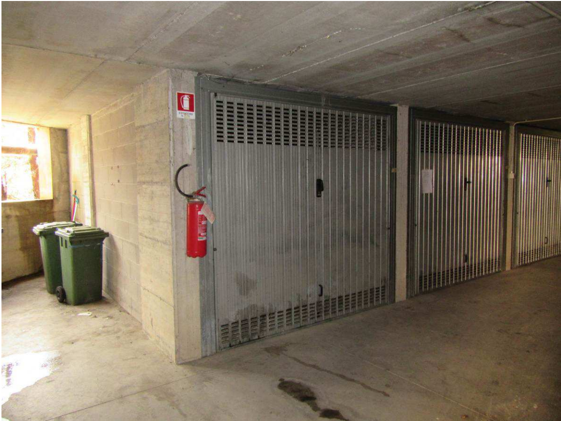
box auto sub. 78