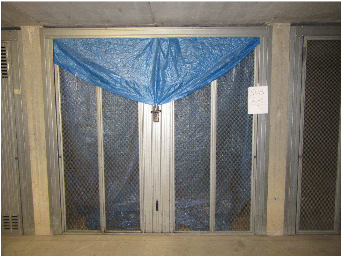
box auto sub. 63