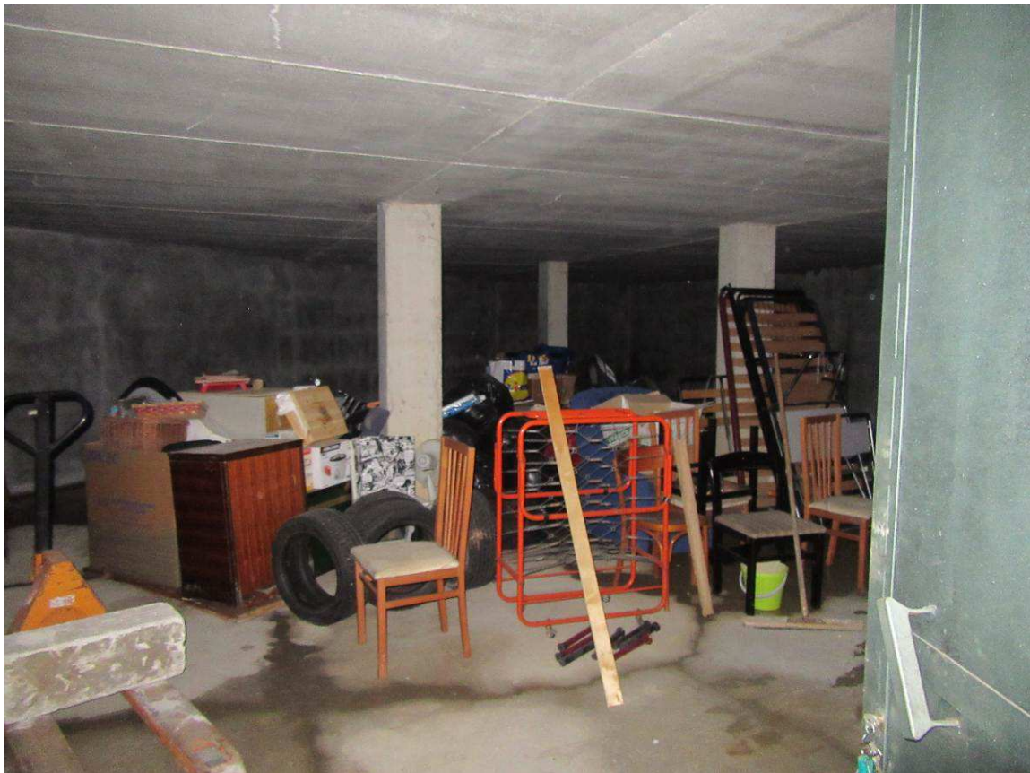
interno magazzino sub. 45