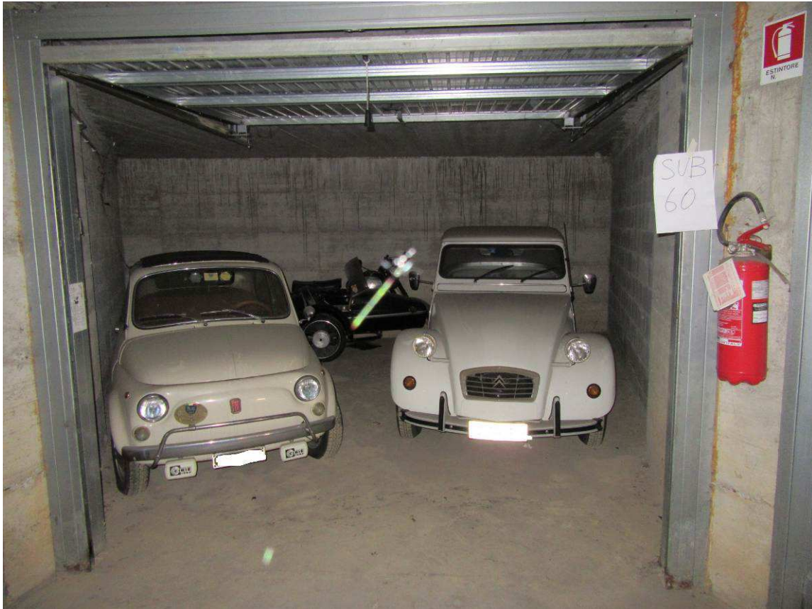
box auto sub. 60