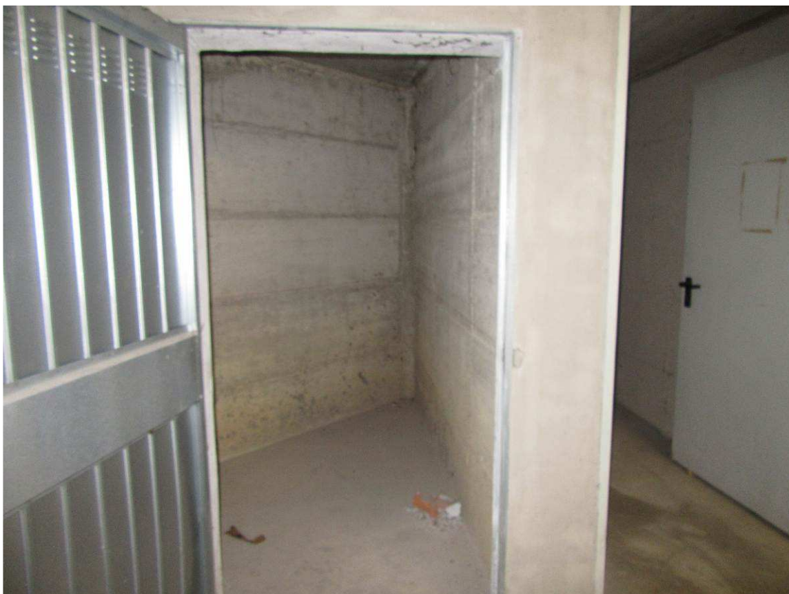
vano cantina sub. 88