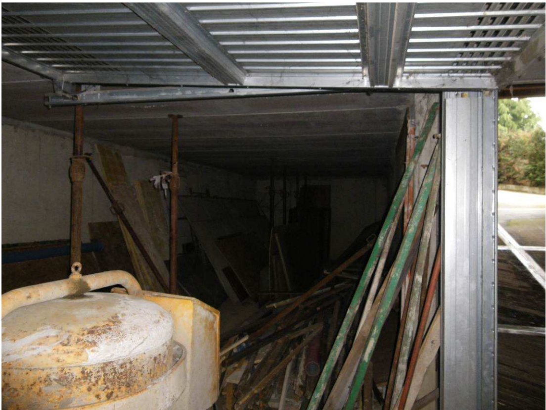
box auto sub. 76