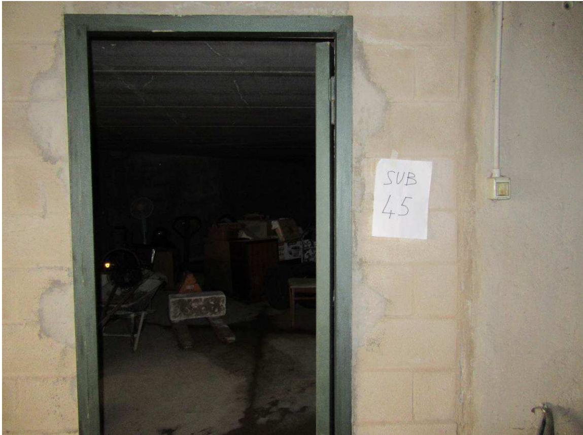
ingresso magazzino sub. 45