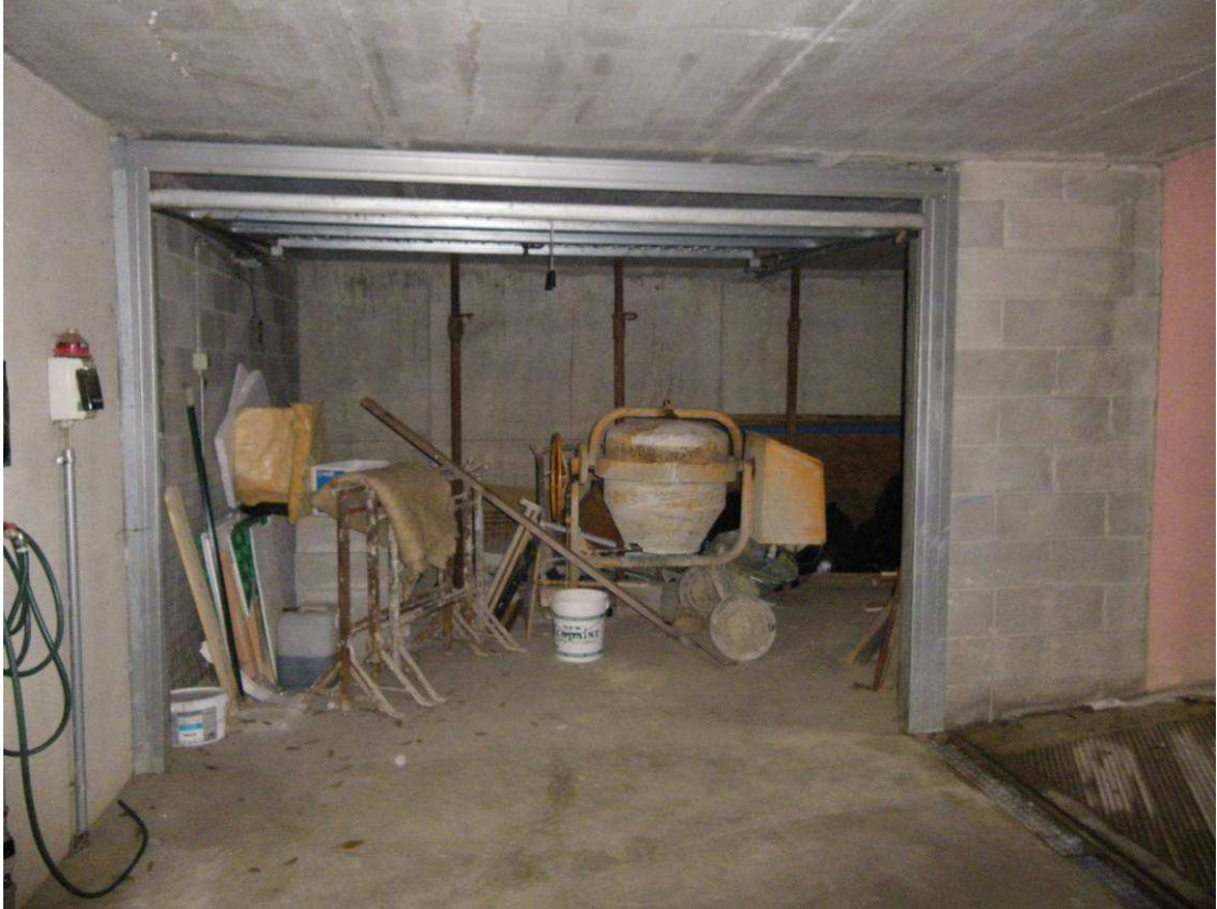
box auto sub. 76