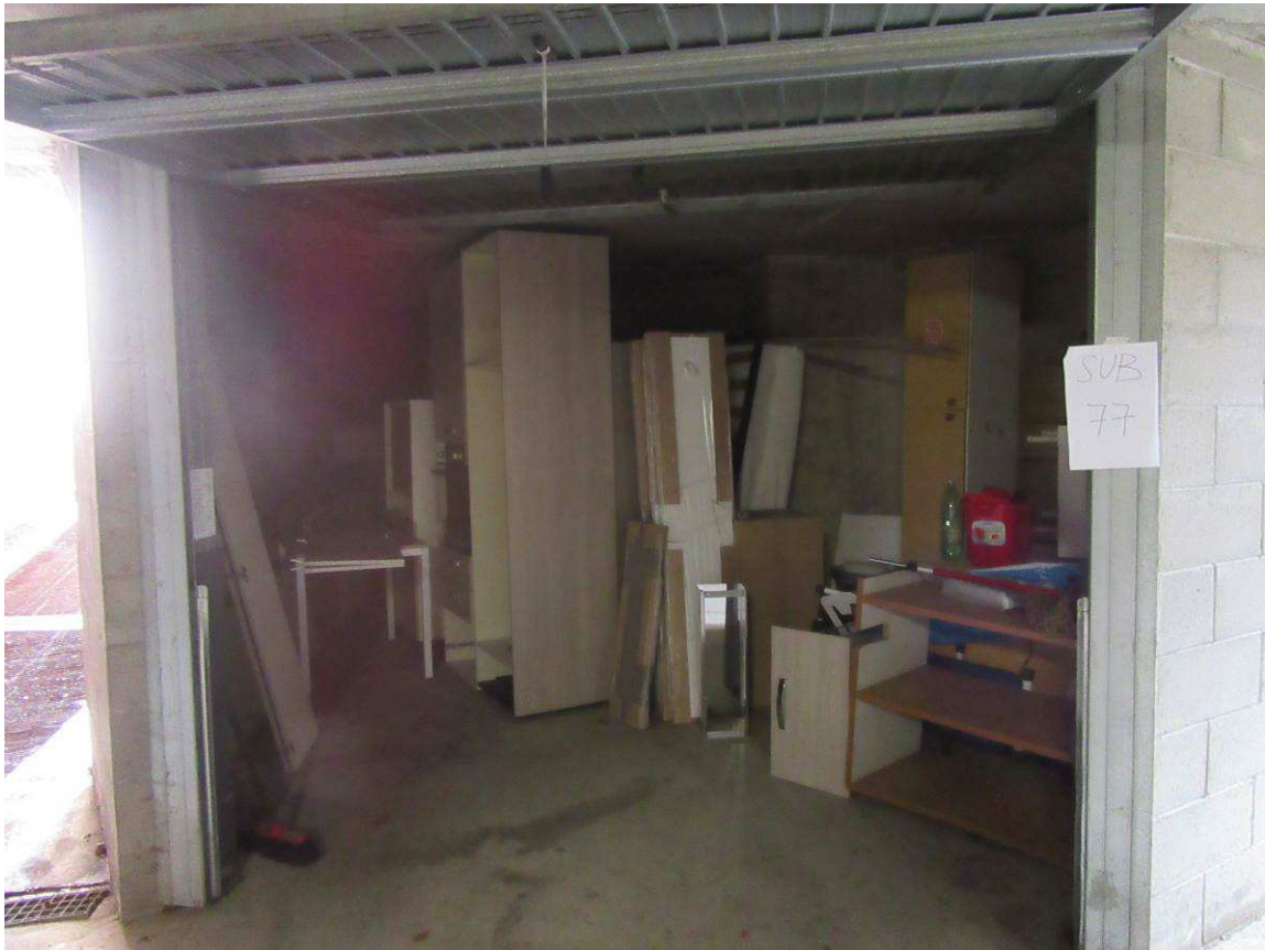
box auto sub. 77