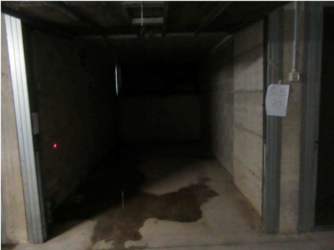
box auto sub. 70