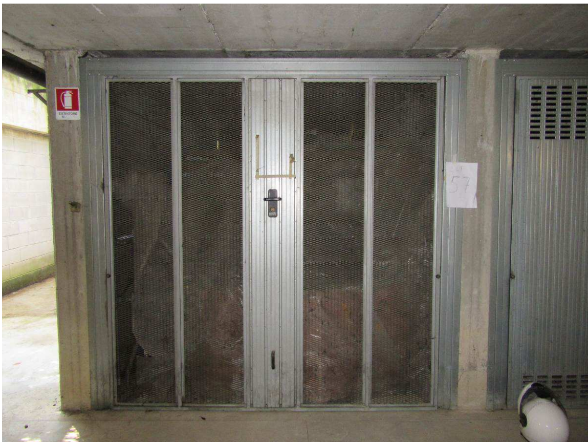
box auto sub. 57