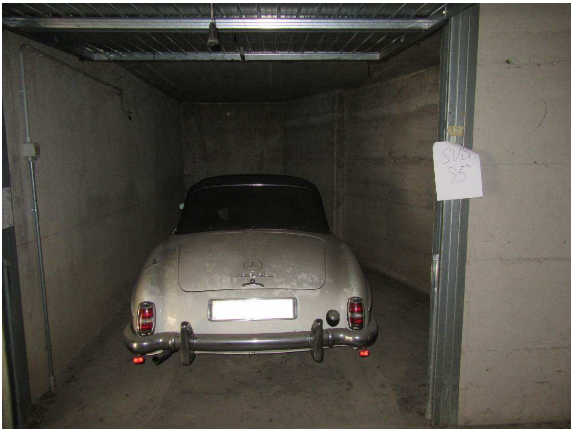
box auto sub. 95