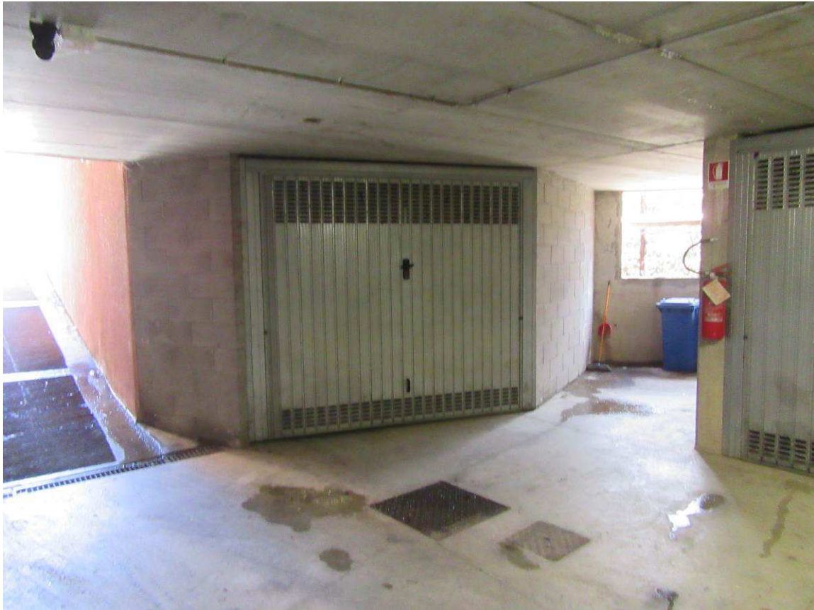
box auto sub. 77