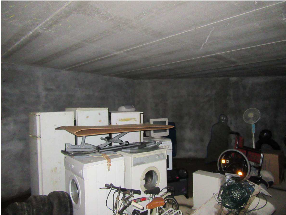
interno magazzino sub. 45