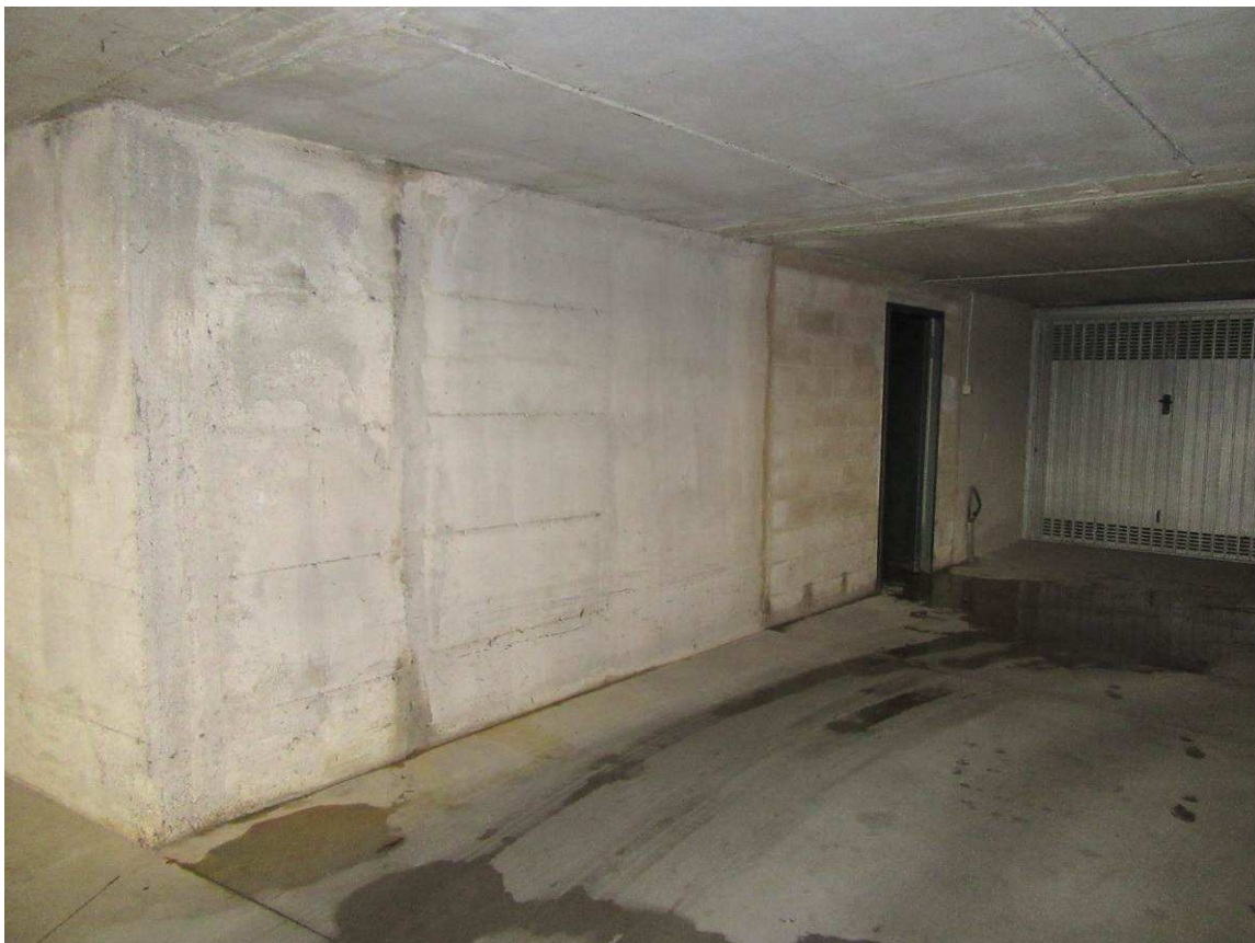
esterno magazzino sub. 45