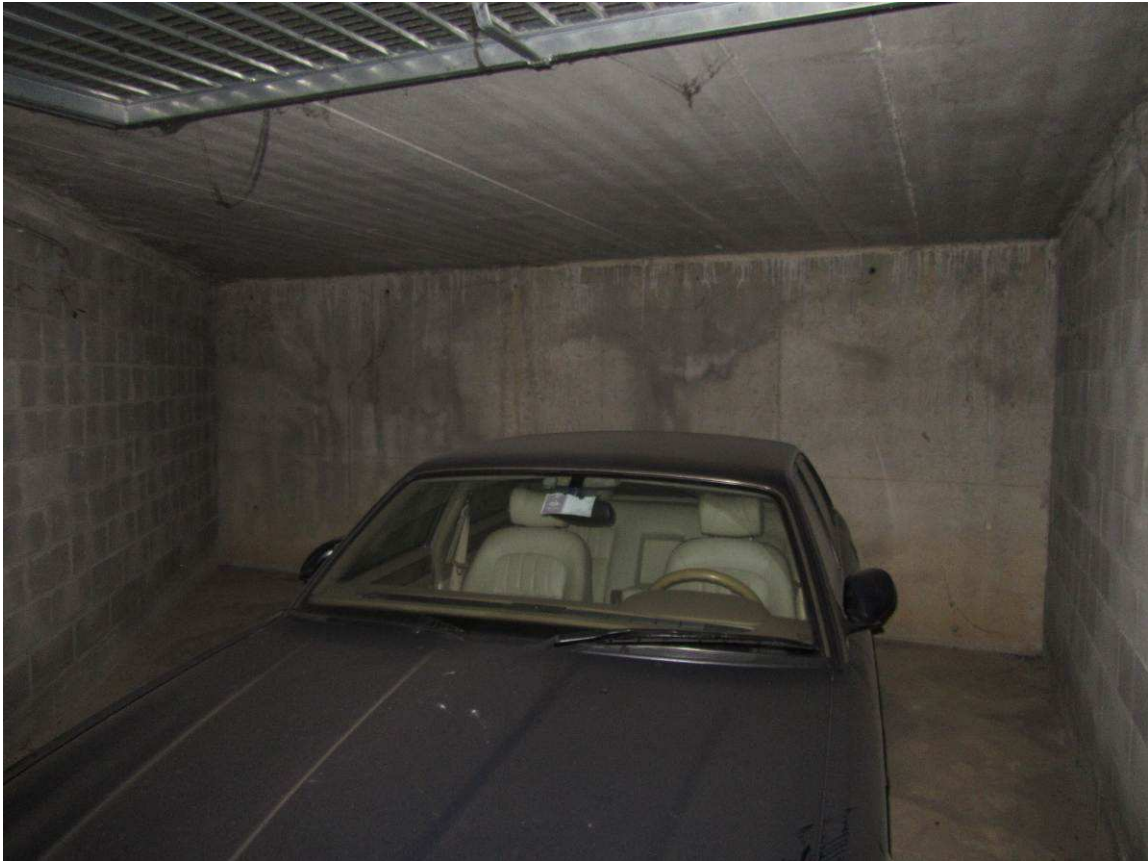
box auto sub. 61