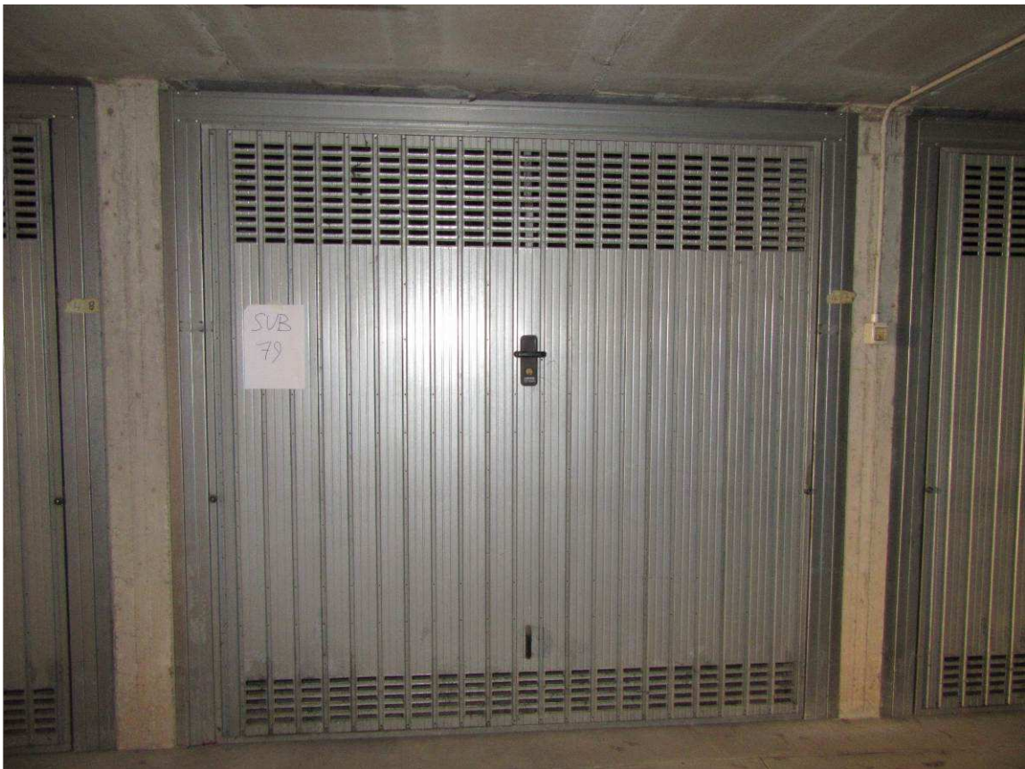
box auto sub. 79