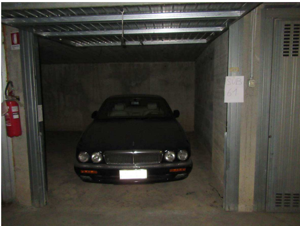
box auto sub. 61