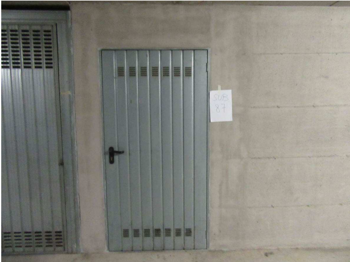
vano cantina sub. 87