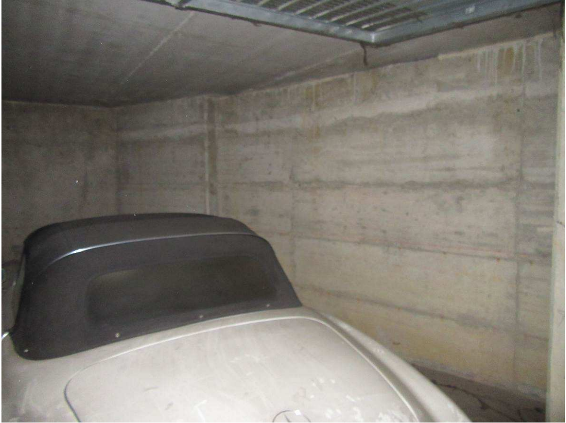
box auto sub. 95