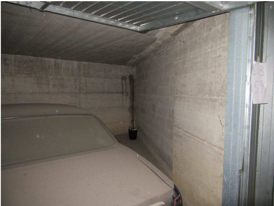
box auto sub. 59