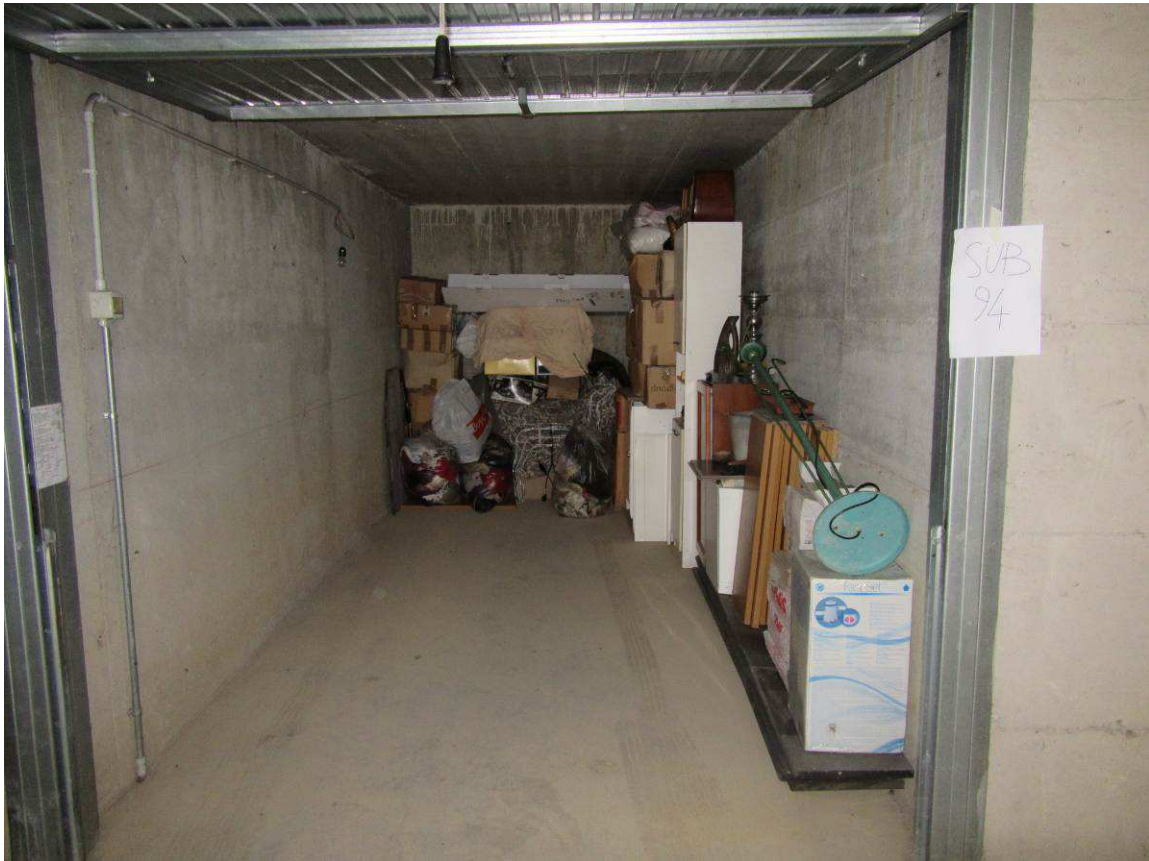
box auto sub. 94