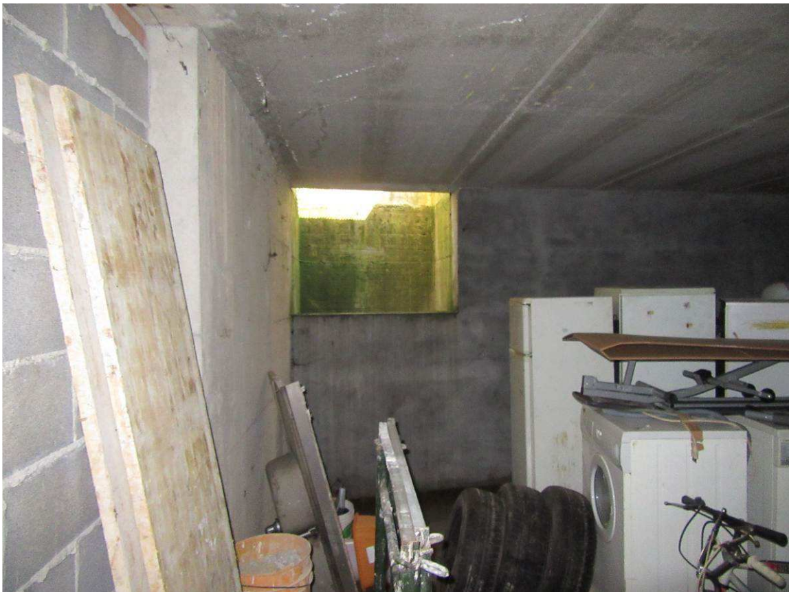
interno magazzino sub. 45