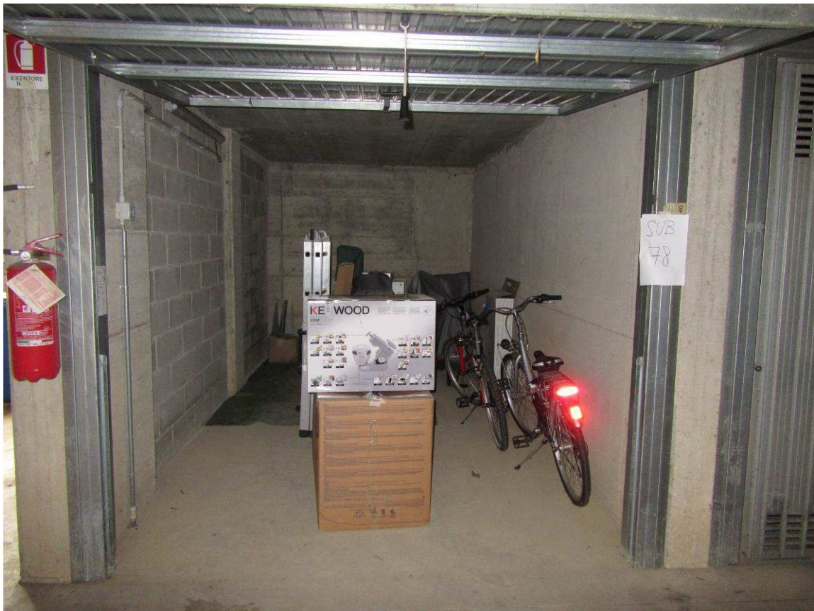
box auto sub. 78