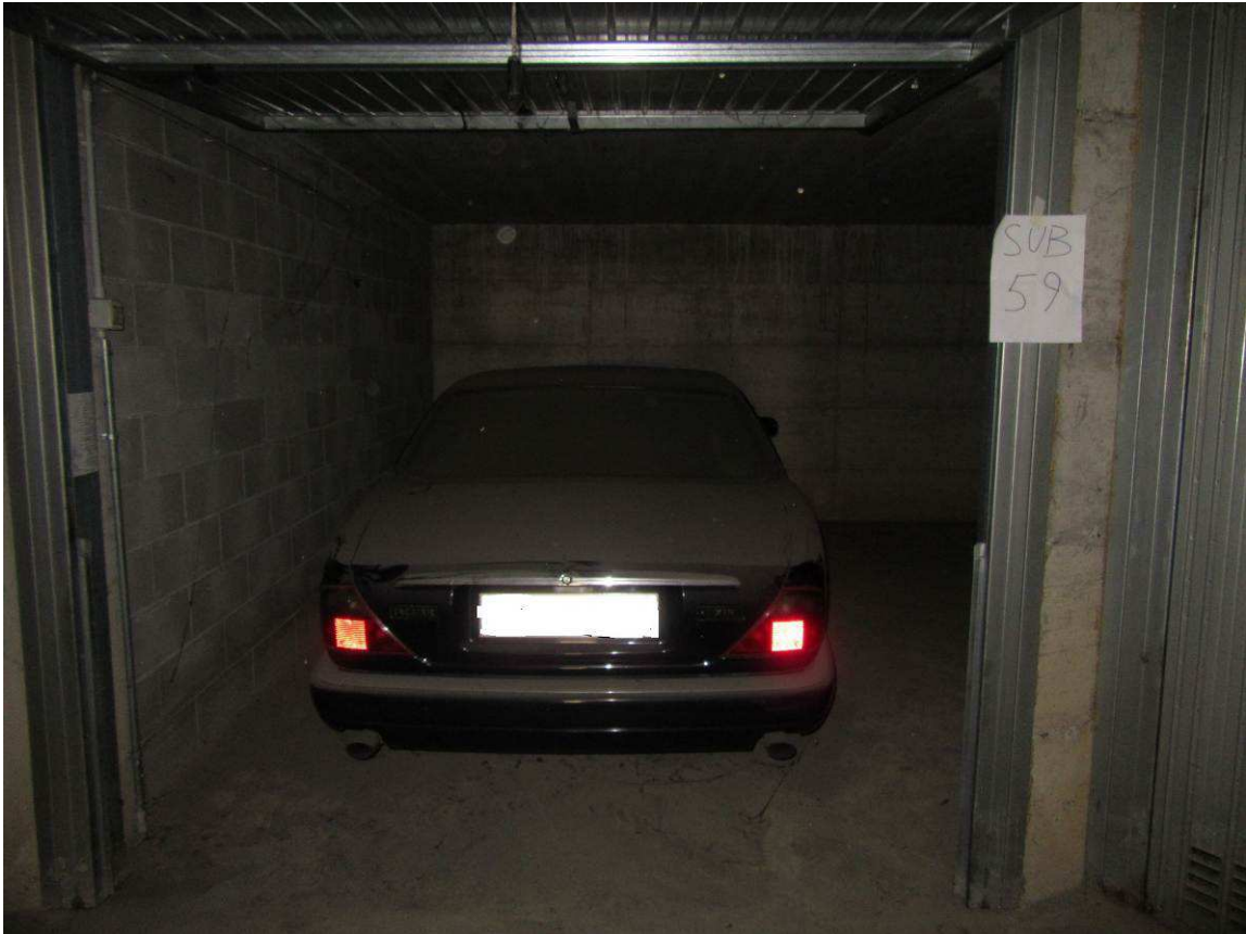
box auto sub. 59