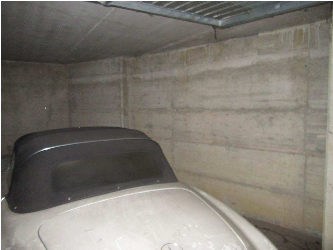
box auto sub. 95