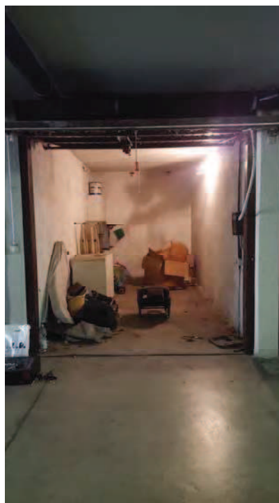
BOX SUB 28