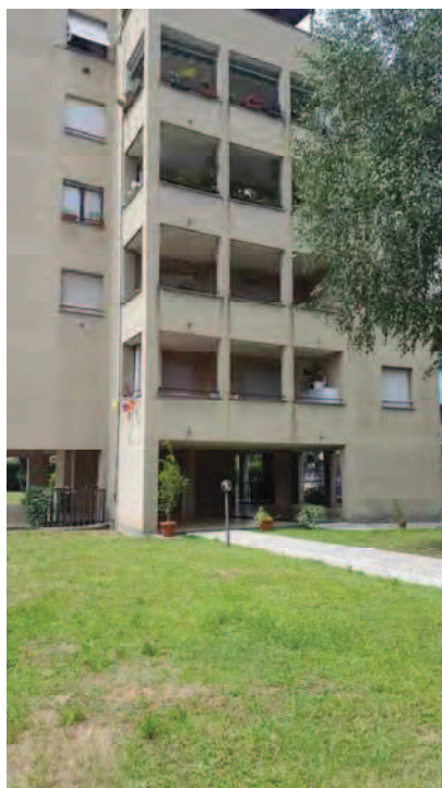
VIA SATTA, 30- FACCIATA