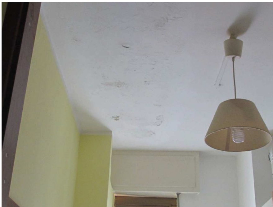
PARTICOLARE SOFFITTO AMMALORATO