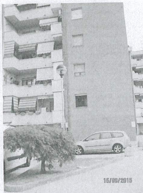
VIA SOGGIORNO/CAMERETTA (P.R.)