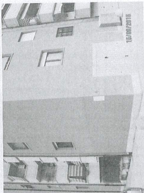
VIA CAMERA/BAGNO (P.R.)