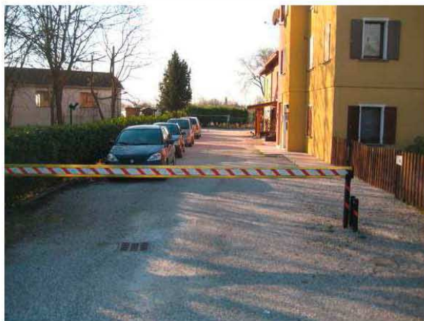
Veduta accesso carraio con sbarrata elettrica e pedonale