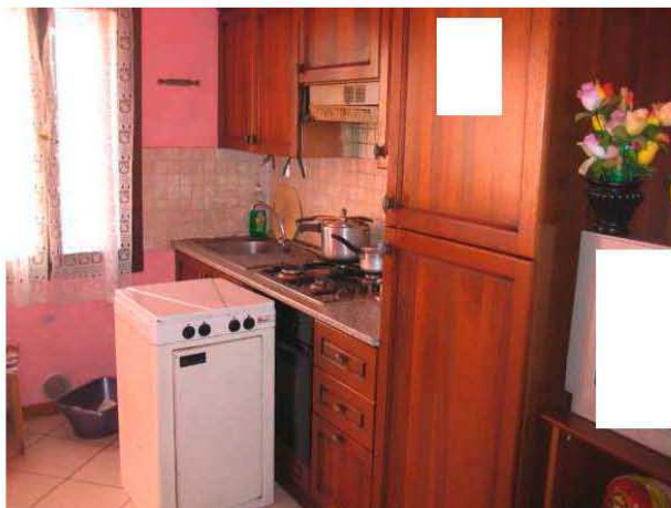
Altra veduta soggiorno/cucina