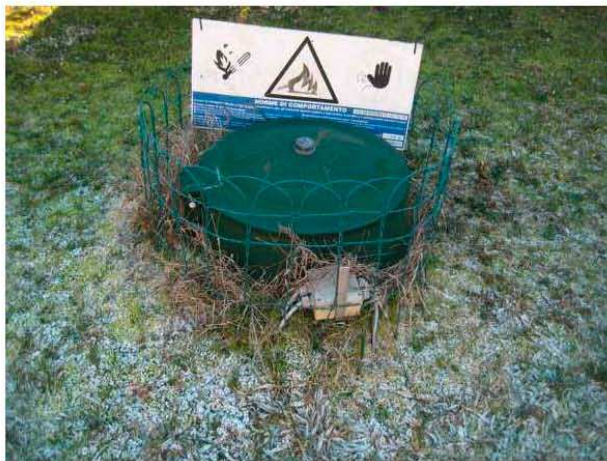
Vista cisterna interrata