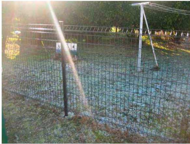
Vista cisterna interrata su proprietà di terzi